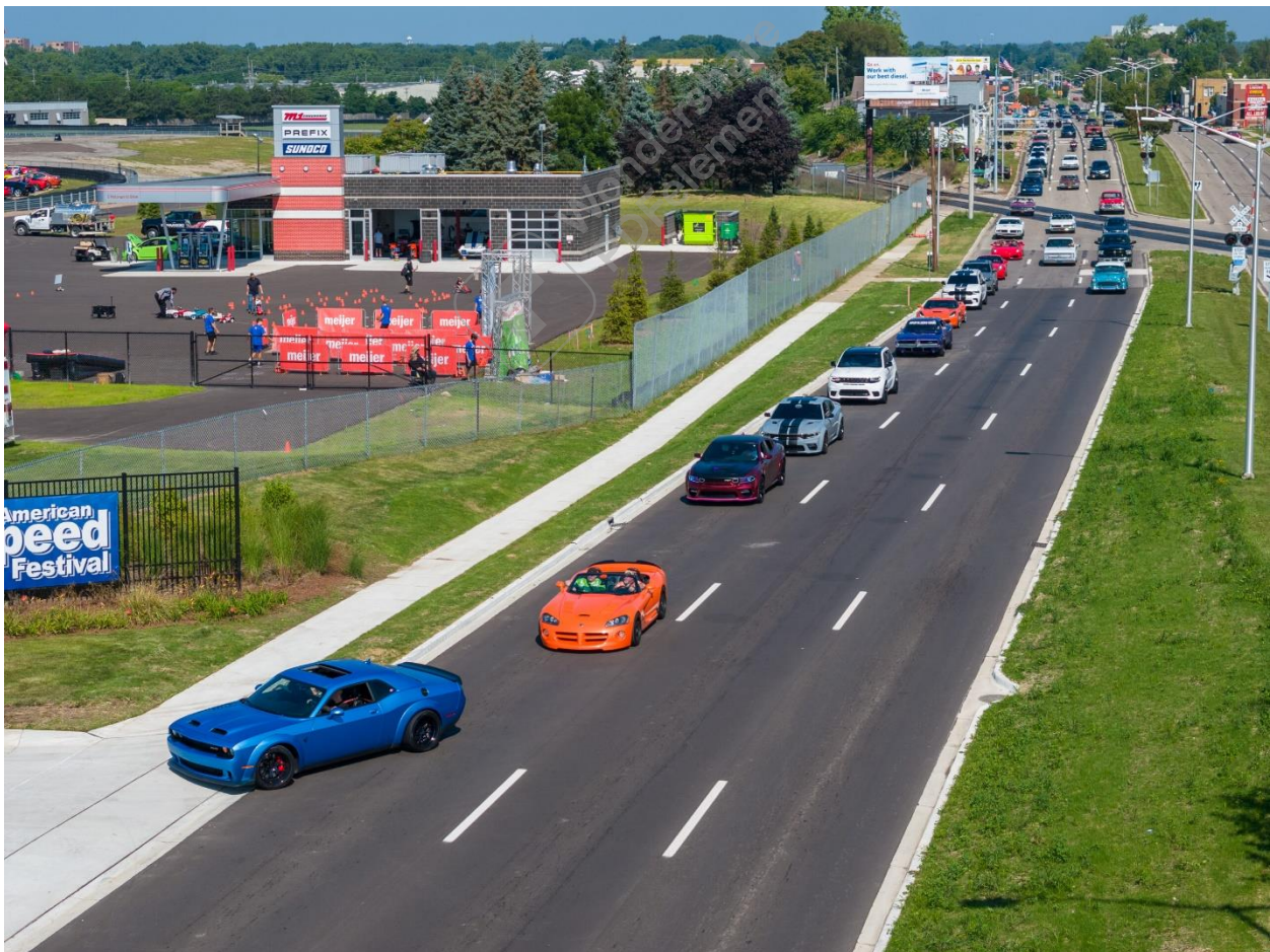
Returning to M1