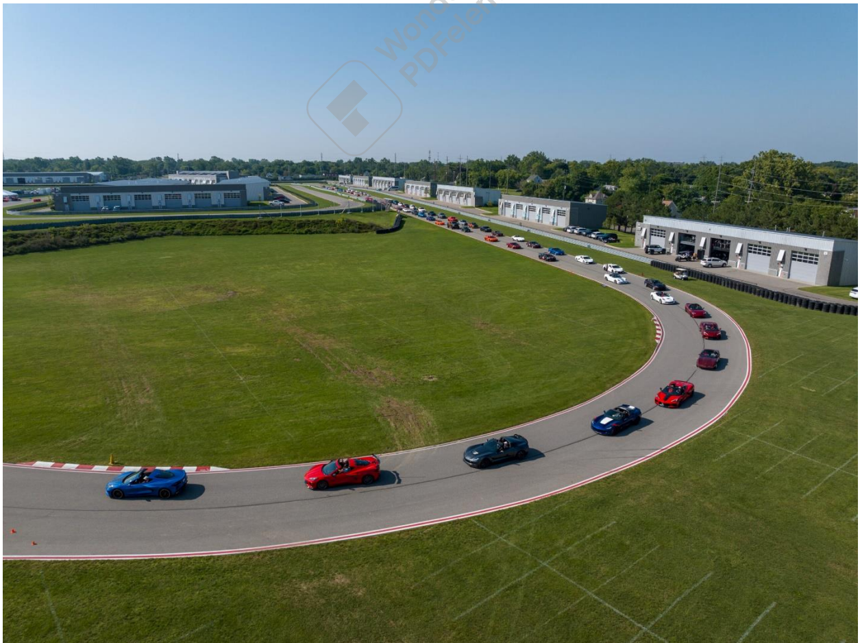
Heading out of M1 for a Cruise on Woodward