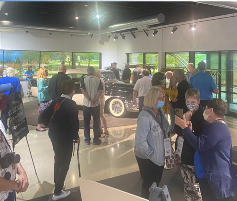
The front lobby where we congregated while everyone was checked in before entering