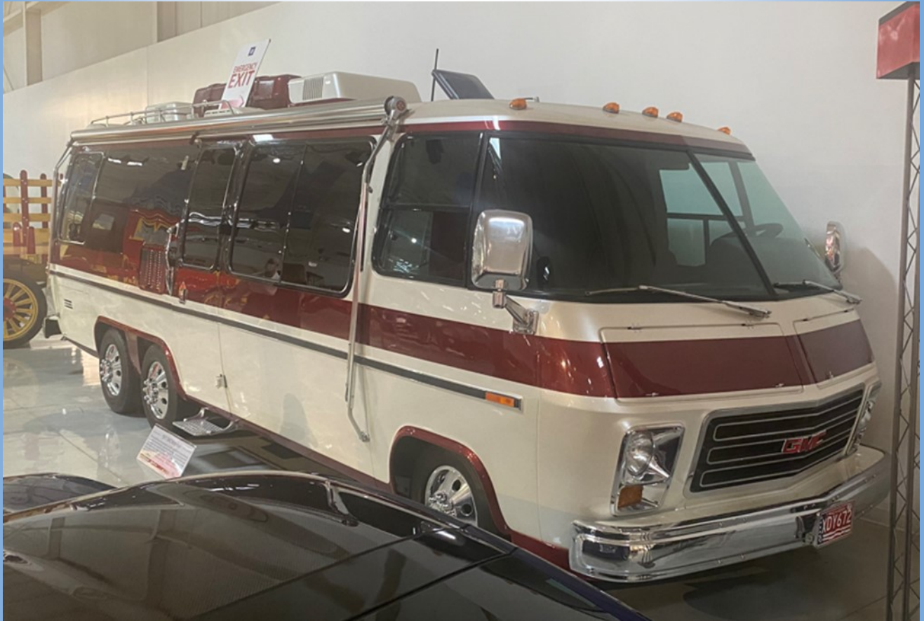
A beautiful GMC motor home above and several GMC trucks below of different vintages.