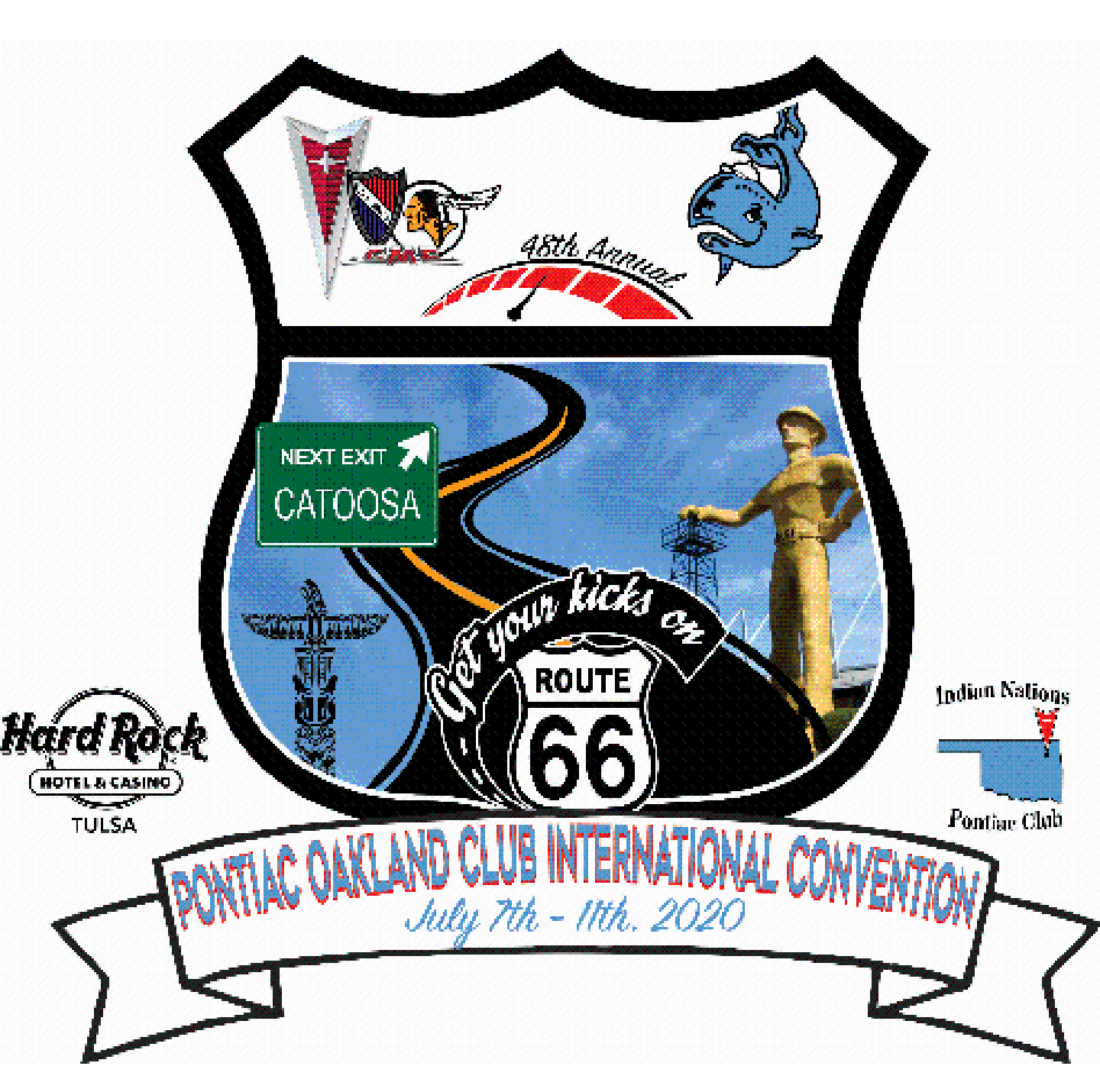
Online registration available at www.poci.org